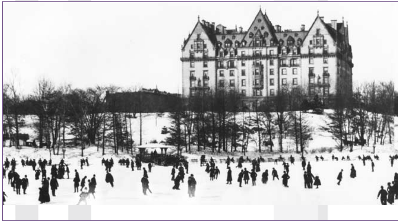
The Dakota

The public appeal yielded feature stories in The Telegraph and The Times and a piece on Radio 4's Today program. Given earlier coverage in The Guardian , The Independent , Country Life and the Evening Standard , it is clear that the Soane Museum is successfully reaching a wide swath of the British public to help it finish the job of Opening Up The Soane .